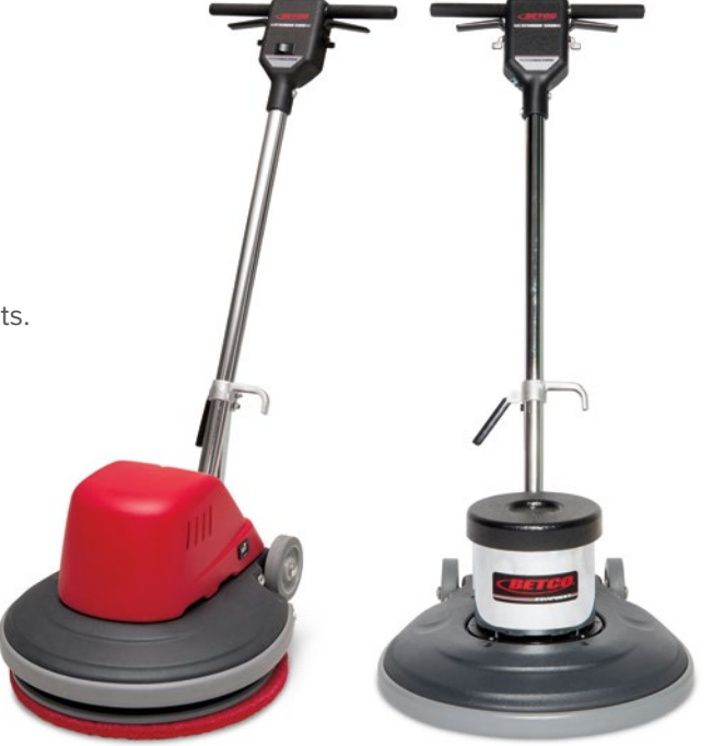
Item #E83013 Crewman™ 17HD Item #E83014 Crewman™ 20HD Item #E83010 Foreman® 20DS