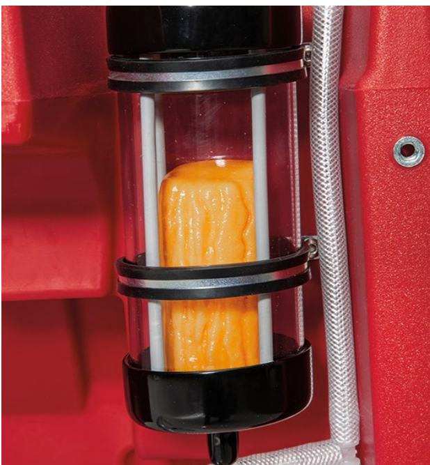
Patented SoliChem Misting Chamber † U.S. Patent No. 11,744,427