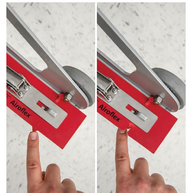
Airoflex® is a registered trademark of the Midwest Rubber Company *Versus leading disk scrubber competitor **Versus leading disk and orbital scrubber competitors