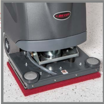
Rugged, high-performance scrub deck with 2-year / 1,500-hour isolator warranty