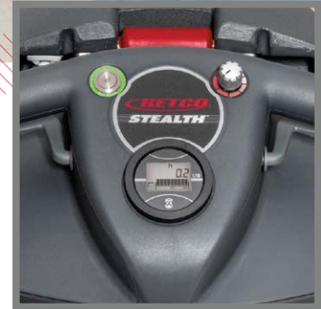
User friendly controls and gauges