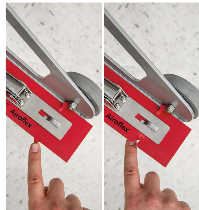
Airoflex® is a registered trademark of the Midwest Rubber Company

*Versus leading disk scrubber competitor