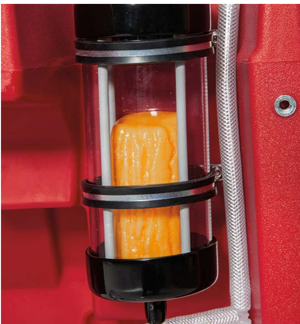
Patent Pending SoliChem Misting Chamber